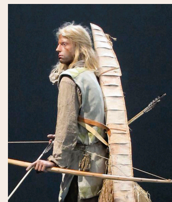
Reconstruction of the owner of the Neolithic bow case.

As early as the 20th century, the discovery of roof tiles on Lake Iffig and a coin near the Wildhorn hut suggested that the pass or at the least the alpine pastures around the lake were used in the Roman Period.